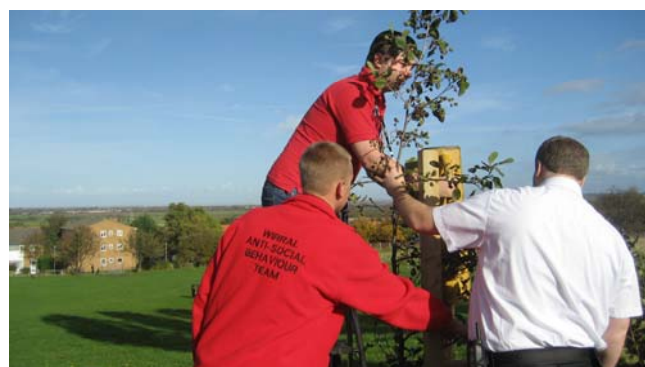
Grange Park, West Kirby

The Grange Park area of West Kirby saw environmental improvements led by the Friends of Grange Park residents' group with the planting of cherry trees and a lantern making workshop with children and young people. Tower Grounds in New Brighton saw local residents lead on an environmental audit with agencies. Work was undertaken in partnership with Leasowe Community Homes, taking the opportunity to speak with residents and young people attending the annual 'Unity in our Community' Halloween fancy dress party.